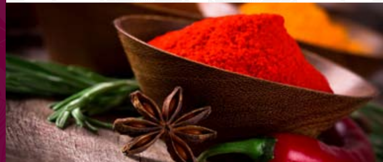
Table A La Carte Menu Available 7 Nights a week. Table Reservations 0141 639 8097 / 8098

Opening Times: 5pm - late, 7 days 198 Harvie Avenue, Newton Mearns G77 6UT